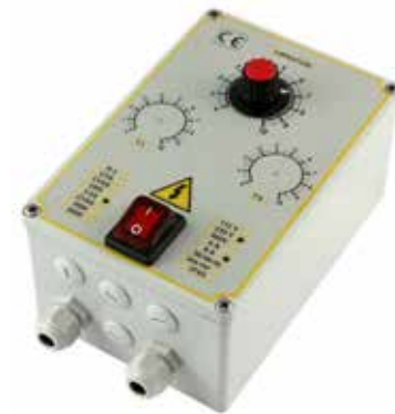
METALLIC BOX CV6F/CV8F PV CV8FX Z2 SM1 PV CV10F Z2 SM1 PV CV12F Z2 SM1 195x130x90