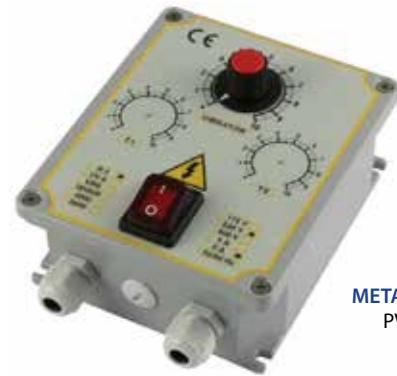
METALLIC BOX CV6F PV CV6FX Z2 STM 165x140x65