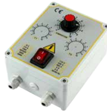
PLASTIC BOX CV6/F PV CV6FX Z2 STP 165x130x70