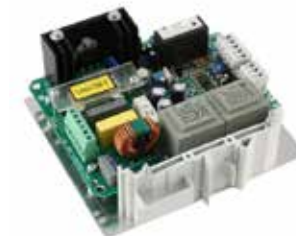
CIRCUIT CV6F/CV8F PV CV6FX D2 STD